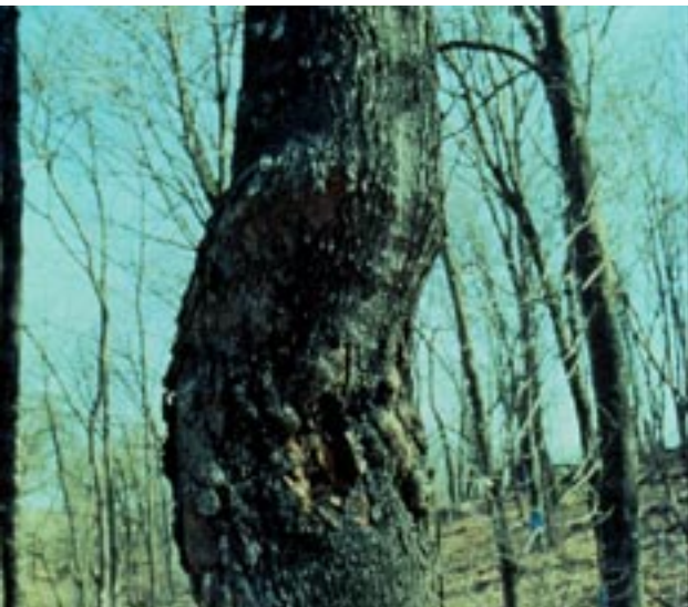
Minnesota DNR and USDA Forest Service