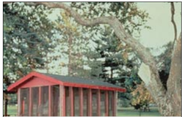
Minnesota DNR and USDA Forest Service