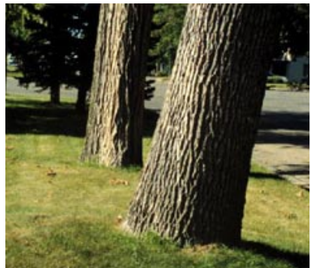
Uplifted soil adjacent to a leaning tree is an indication of a hazard tree.