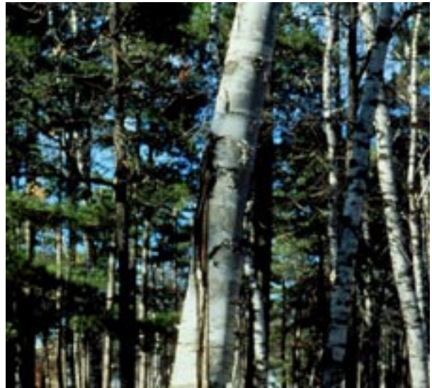
Minnesota DNR and USDA Forest Service