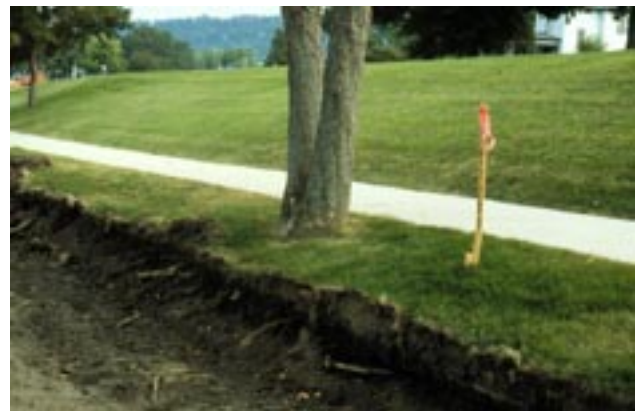
Damage to tree roots from constuction of a sidewalk.