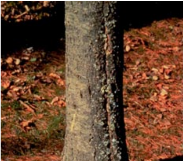
Minnesota DNR and USDA Forest Service